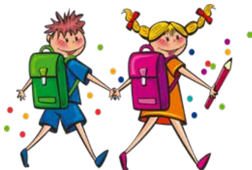
Back to School!

Please note: Coffee will no longer be provided at the Monday morning meeting. It will resume in October 2023.