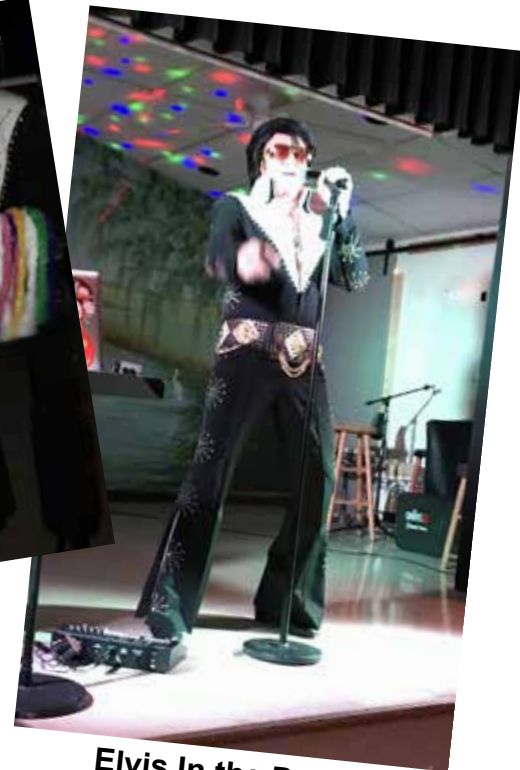
Elvis In the Park!