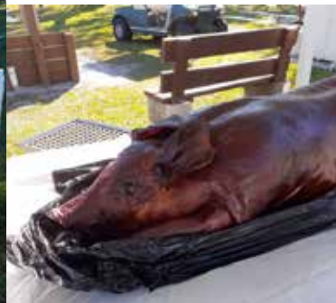
Pig Roast/Pot Luck