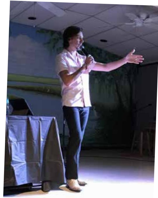
Charlie's Country Soul