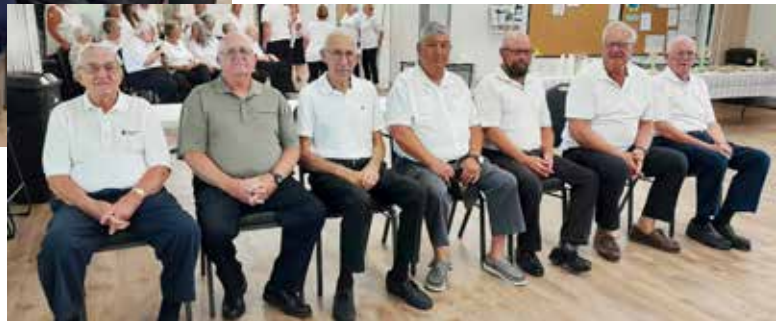
Military flag bearers