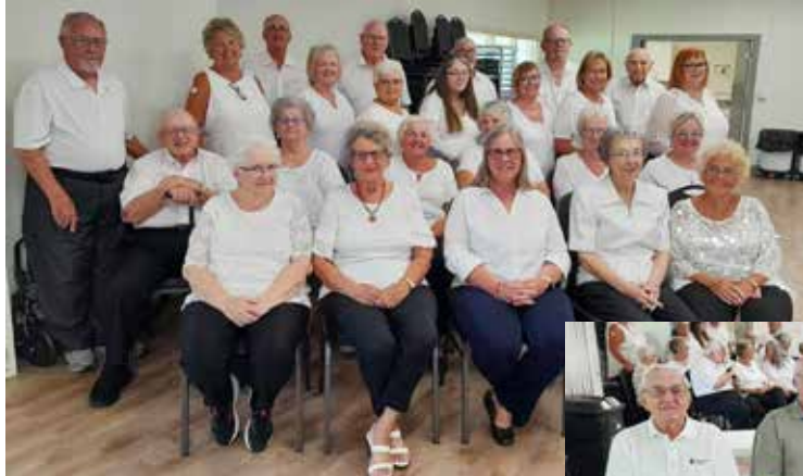
Chorus recital Singers