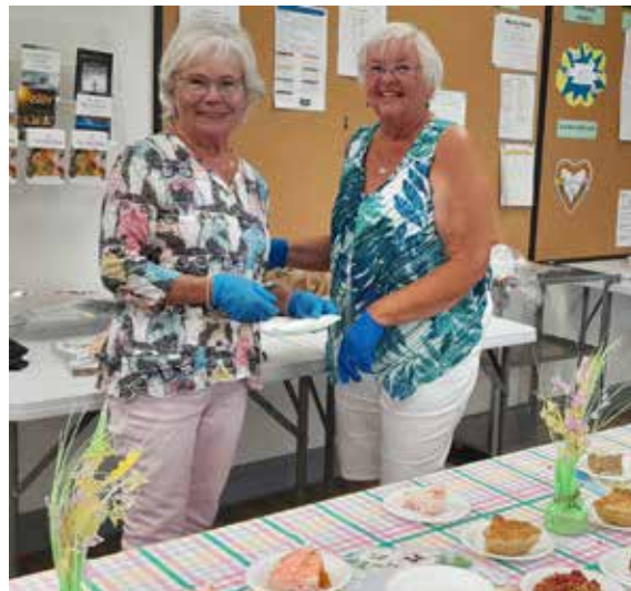
Easter - serving desserts