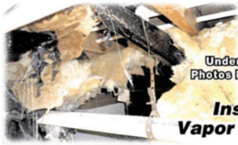
Underhome Photos Provided

Insulation Under Your Home Falling Down? Holes and Tears in Your Vapor /Moisture Barrier?