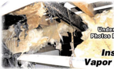
Underhome Photos Provided

Insulation Under Your Home Falling Down? Holes and Tears in Your Vapor /Moisture Barrier?