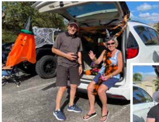
Church Trunk to Treat