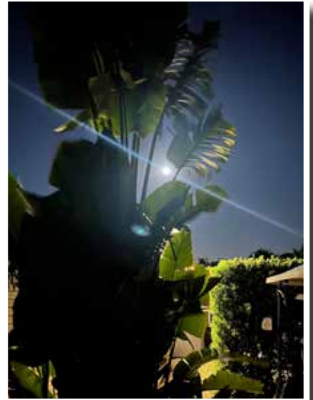
Another Great Sunset