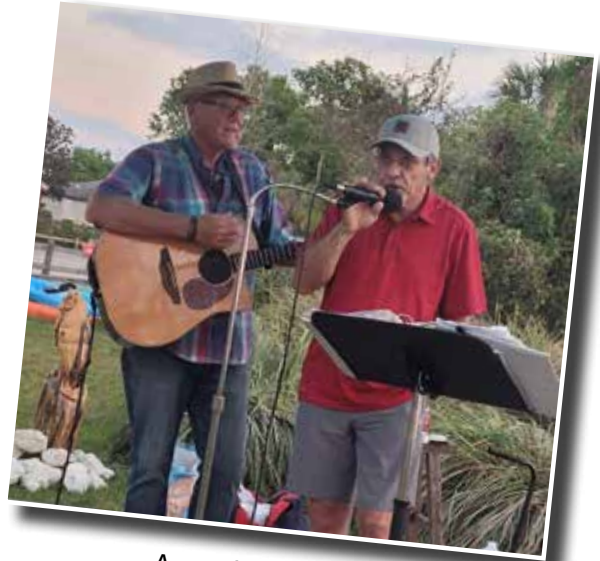
A rest from editing