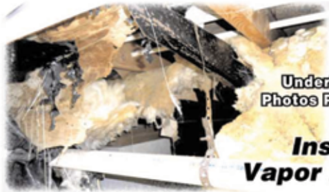
Underhome Photos Provided

Insulation Under Your Home Falling Down? Holes and Tears in Your Vapor /Moisture Barrier?