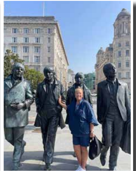
Sonya meets the Beatles