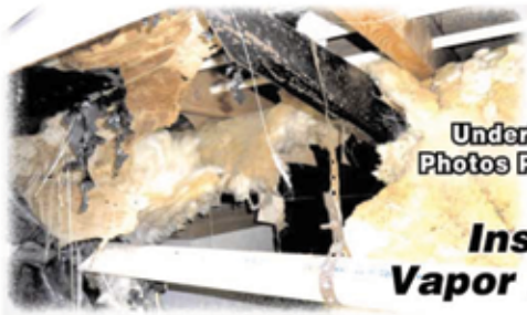
Underhome Photos Provided

Insulation Under Your Home Falling Down? Holes and Tears in Your Vapor /Moisture Barrier?